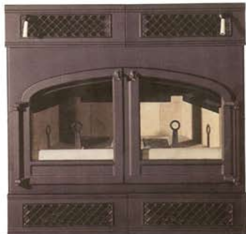
Sequoia shown with cast lattice louvre kit.